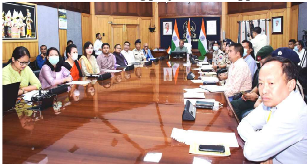
IT News Imphal, Sept 13:

Senior officers shouldn't make any discrimination among their subordinates during performance appraisal - Chief Minister